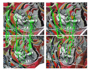
Figure 2: Qualitative evaluation on "Wall' image from the Oxford dataset.

We evaluate the proposed model both quantitatively and qualitatively and show its capability of identifying multiscale keypoints as well as matching them. We show that the descriptors outperform previous approaches and demonstrate the transferability to unseen datasets with different statistics; Figure 2 shows an example.