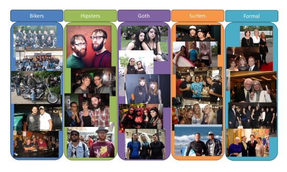
Figure 2: Examples of social groups in our Urban Tribes dataset. The images show a wide range of inter-class and intra-class variability. More details can be seen at the dataset website.

Results. We set up classification experiments where training and testing images were randomly selected from each of the categories for 50 different iterations. For each experiment, a fixed number of the images from each class are used for learning the models and the rest of images are used for testing. An image is correctly classified if the most likely group label matches the ground truth labels. In Fig. 3, we provide confusion matrices for classification results using two different modeling approaches.