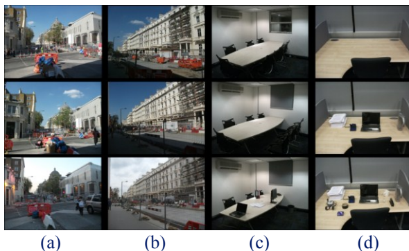
Figure 1: Images representing places of interest along a tour of the environment. (a) and (b) are outdoor scenes influenced by dynamics such as pedestrians, cars and weather conditions. (c) and (d) are indoor scenes influenced by manually-induced dynamics such as the rearrangement of furniture. These rearrangements took place after the 3 rd and 8 th tour.

The indoor dataset was of shorter length, but was generated with the aim of testing the system to more dramatic long-term dynamic behaviour. 200 discrete places were captured over a path length of 200m, with subsequent tours capturing \sim 200 images per tour. A total of 12 tours were recorded, however, after 3 tours and again after 8 tours, significant structural rearrangements were made to all scenes where possible. Such rearrangements included moving furniture and objects, and opening or closing doors and blinds. See Figure 1 (c) and (d) for examples.