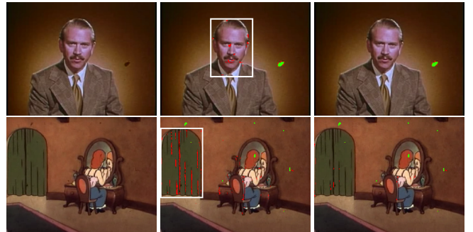
Figure 1: Example results: (left) original images (middle) HAFID results before false alarm elimination, and (right) after false alarm elimination.

For those false alarms that make up an entire moving region, for example, the shadows in the curtain folds in the bottom row example in Fig. 1 which leave the scene as the camera pans and zooms in towards the girl, no relationship with other pixels may be found unless we trace forwards and backwards on the temporal axis. The pyramidal Lucas-Kanade feature tracker is adopted here in order to impose temporal constraints.